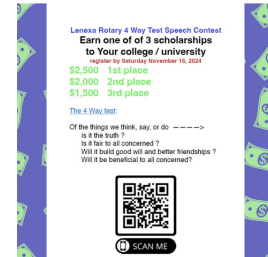
Lenexa Rotary Speech Contest