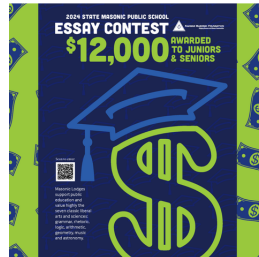
Kansas Masonic Foundation Scholarship